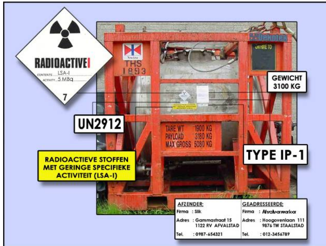
Transport van LSA-I materiaal in verpakking type IP-1: Stoffen met geringe specifieke activiteit.